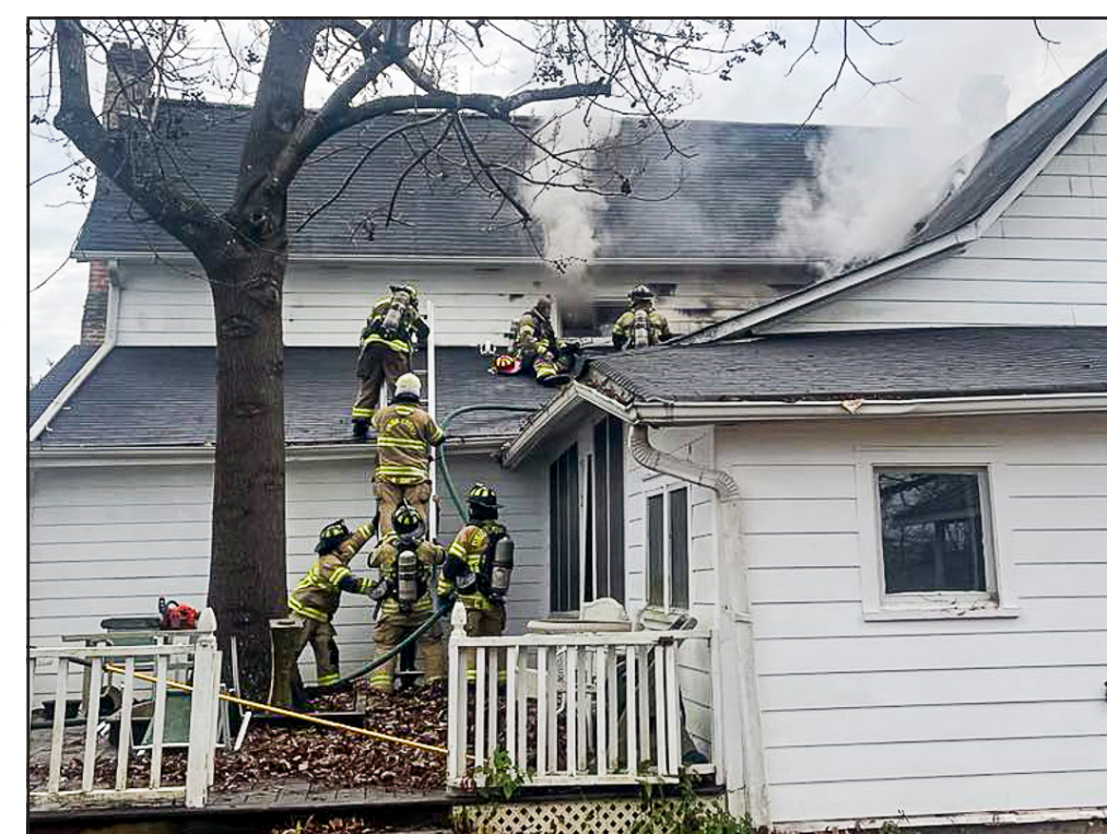
Firefighters had to work quickly to save the historic Reid-Sampson House after a fire there

it where it's at, and to have this many people show up to help us fight the fire - there's more than just one job to fighting fire, there's a lot of exterior work. So, to me, it's a pretty See Reid-Sampson Fire, Page 3A