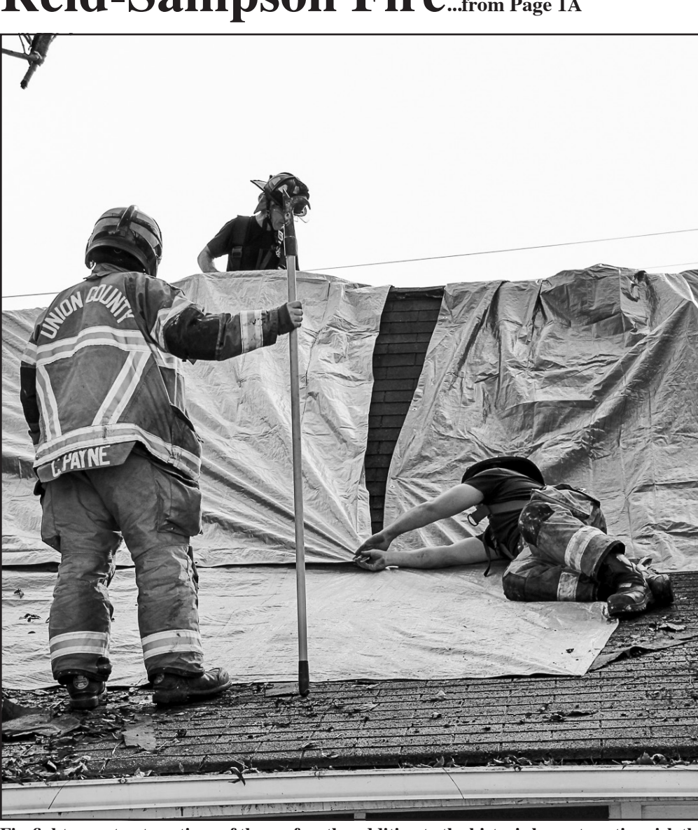
Firefighters cut out portions of the roof on the addition to the historic home to extinguish the blaze Sunday, after which they covered the holes with tarps.

amazing stop, and everybody did an awesome job."